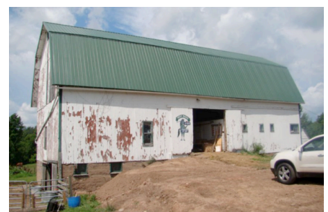
West Barn circa 2013.