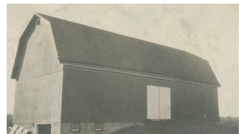
West Barn circa 1924.

Future plans involve renovating the barn to transform it into a functional space for classrooms and community gatherings.